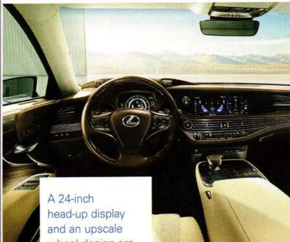
A 24-inch head-up display and an upscale wheel design are new as stand-alone options.

The 2019 Lexus LS 500 no doubt defines flagship. It's beautiful and proud and provides driving therapy during long freeway hauls. It's a modernized version of the traditional big sedans of yesteryear.